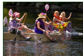
Cardboard Boat Races