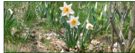
Afternoon "Dig-In" with our volunteer "Garden-Tenders"

If you are interested in getting your hands dirty and growing beautiful gardens for the public to enjoy, Please send an email to info@hudsoncrossingpark.org