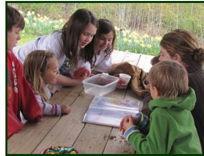
Sunday Afternoons in the Park